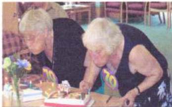
Our birthday was 140 th and 80 people came!